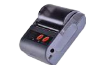
Wireless Bluetooth Printer