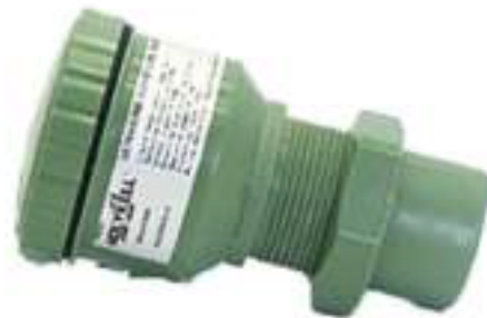
UE3005 Ultrasonic Level Sensors Installation Example